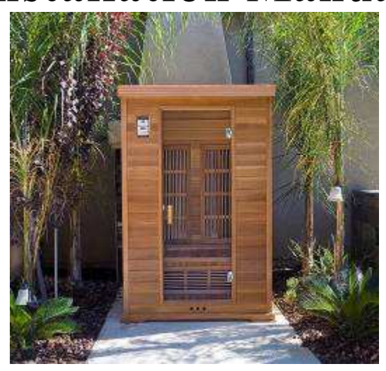
A Brighter Future...

www.westcoastsaunas.com service@westcoastsaunas.com