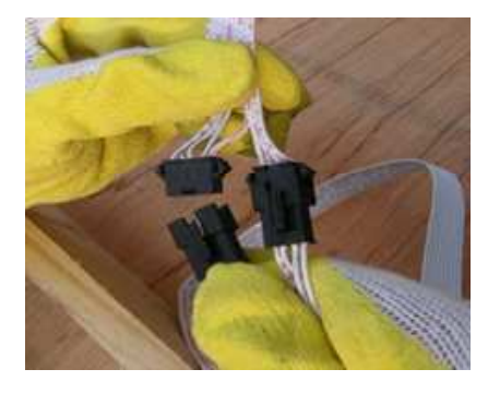
Optional LCD/DVD Connections